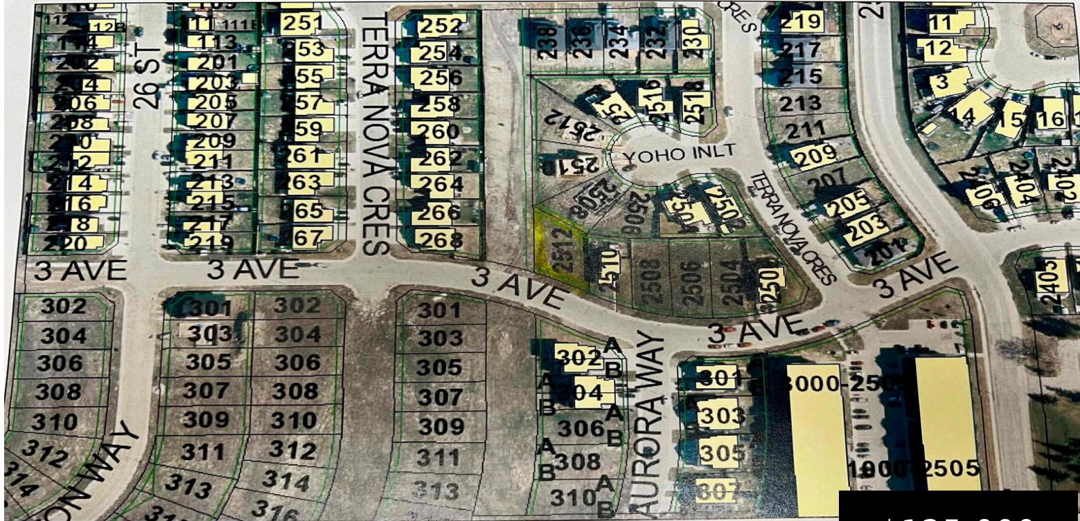
City of Cold Lake Web Map